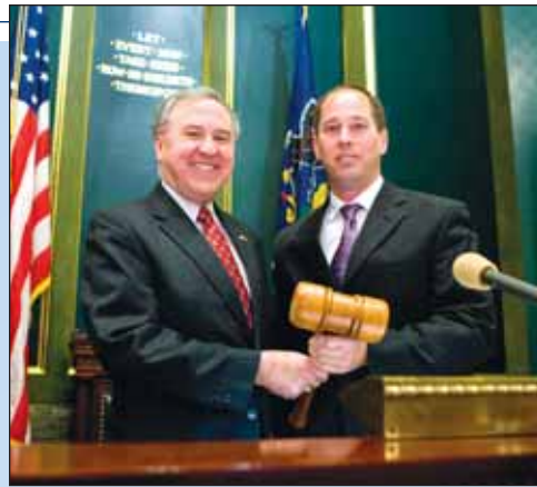
Sen. Rafferty with Sen. Joe Scarnati in the Senate Chamber during swearing-in ceremonies for Sen. Scarnati as Senate President Pro Tempore. Sen. Rafferty presided over the ceremony.