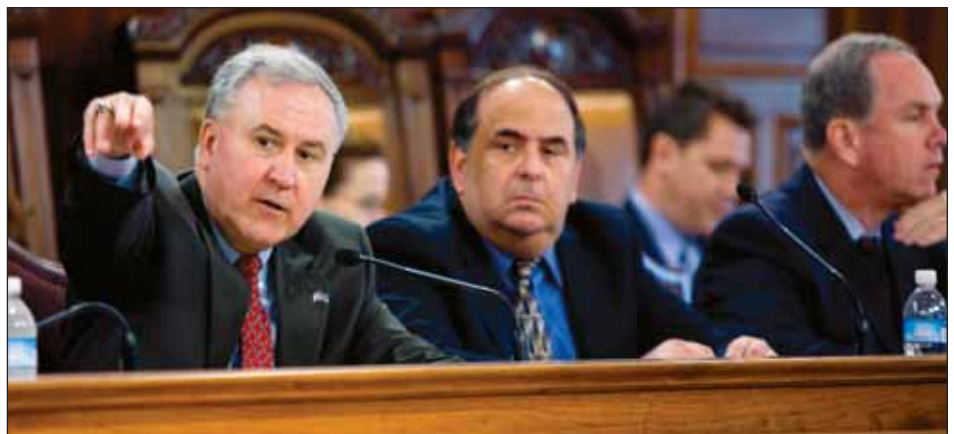
Sen. Rafferty, former chairman of the Senate Law & Justice Committee, now heads the Senate Transportation Committee.

Transportation issues affect every resident in Pennsylvania, whether it involves a daily commute to work or a bus ride on the public transit system or the movement of goods. Our goal is to have a modern, efficient system that meets the needs of its users.