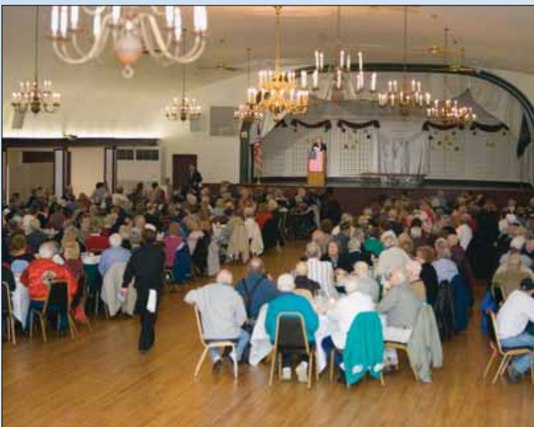
More than 350 people, military veterans and their guests, packed the Sunnybrook Ballroom for the second annual Veterans Appreciation Breakfast.

It was my honor to salute the men and women who served and continue to serve in the Armed Forces. They gave of themselves for us; now we can show a level of our appreciation to them.