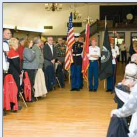
A color guard opened the program which saluted veterans from the Army, Navy, Air Force, Marine Corps, Coast Guard and Merchant Marine.