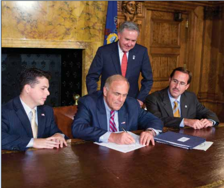
Sen. Rafferty, then chairman of the Senate Law and Justice Committee, watches as Gov. Rendell signs SB 369, the Emergency and Law Enforcement Personnel Death Benefits Act.