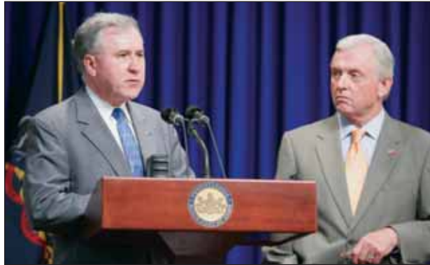
Senator Rafferty speaking at the GPS Monitoring for Sex Offenders press conference.

Senator Orié and I are also sponsoring Senate Bill 1130 to require Pennsylvania to implement the Adam Walsh Child Protection Act, which seeks to create a national sex offender registry available on the Internet as well as uniform enforcement.