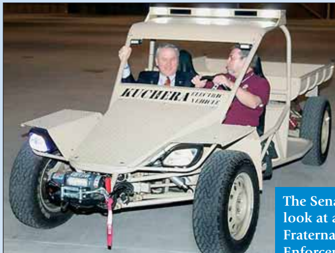
The Senator gets a first-hand look at an electric vehicle at a Fraternal Order of Police Law Enforcement Expo.