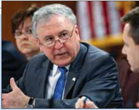
Sen. Rafferty speaks during budget hearings.