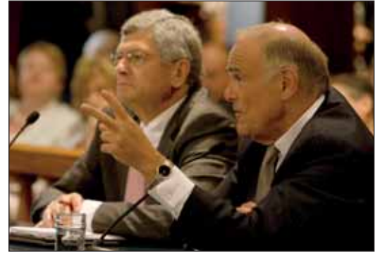
Sen. Rafferty, chairman of the Senate Transportation Committee, left photo, questions Governor Rendell during a hearing in Harrisburg on transportation funding issues.

sues. In upcoming hearings we hope to hear suggestions from those in the private sector on how we can make the best use of tax dollars and find innovative new ways to meet our growing needs.