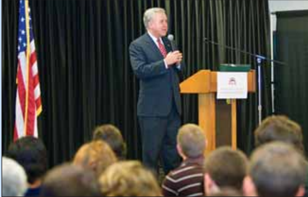
Sen. Rafferty addresses students who became "Senators for a Day" and got a hands-on look at how legislation works its way through the Pennsylvania Senate and is defeated or becomes law.